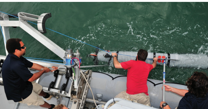
Peraton technicians assigned to Naval Information Warfare Center-Pacific conduct testing of Mk 18 Mod 2 unmanned underwater vehicle.

"We're looking at every opportunity to help the Navy identify and close capabilities gaps where autonomy is concerned," Hagan said.