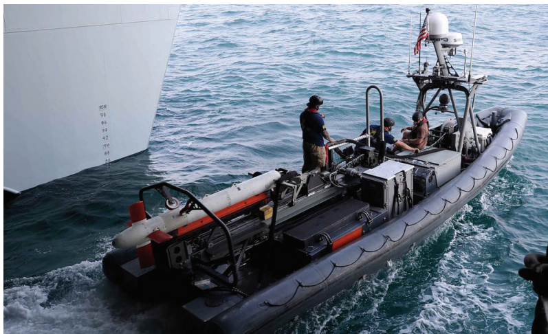
Peraton technicians assigned to Commander Fifth Fleet's mine warfare task force pilot a prototype Mine Countermeasures Unmanned Surface Vehicle out of RFA Mounts Bay's well deck during a US-UK bilateral exercise.