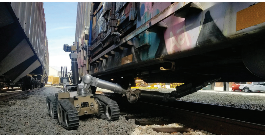
Peraton Remotec systems such as the Andros™ FX Unmanned Ground Vehicle allow remote users to find, identify and remove explosive devices while operating in environments that require high levels of robotic mobility and dexterity.

“Peraton acquired Peraton Remotec with the goal of leveraging their expert staff and 72,000-square foot facility in Tennessee to provide the production