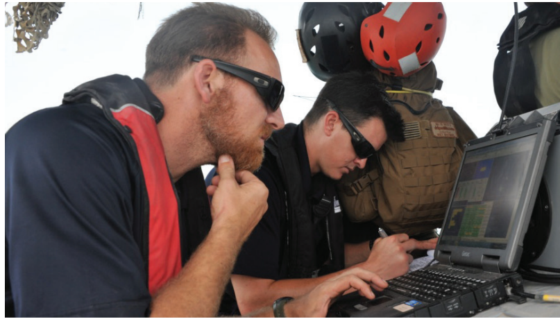
Peraton technicians assigned to Naval Information Warfare Center–Pacific conduct post-mission analysis of a Mk 18 Mod 2 unmanned underwater vehicle.

“We want to set ourselves up as the single point of contact for the government for making the different pieces of a very complex unmanned system of systems work together seamlessly,” Hagan said. “Peraton is excited to pair our real-world experience working with this precise type of system—an unmanned, auto-